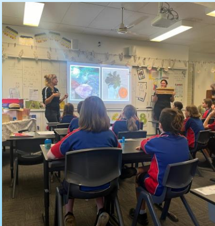
Invasive species talk.