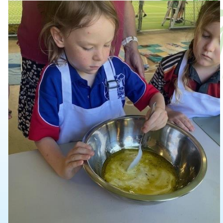
Stephanie Alexander Kitchen Garden sous chefs hard at work.